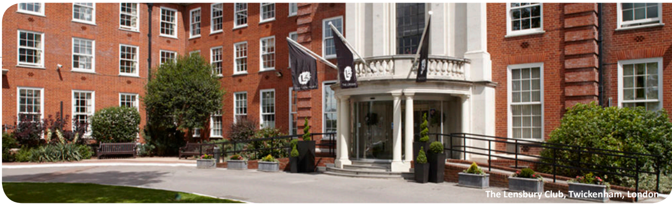
The Lensbury Club, Twickenham, London