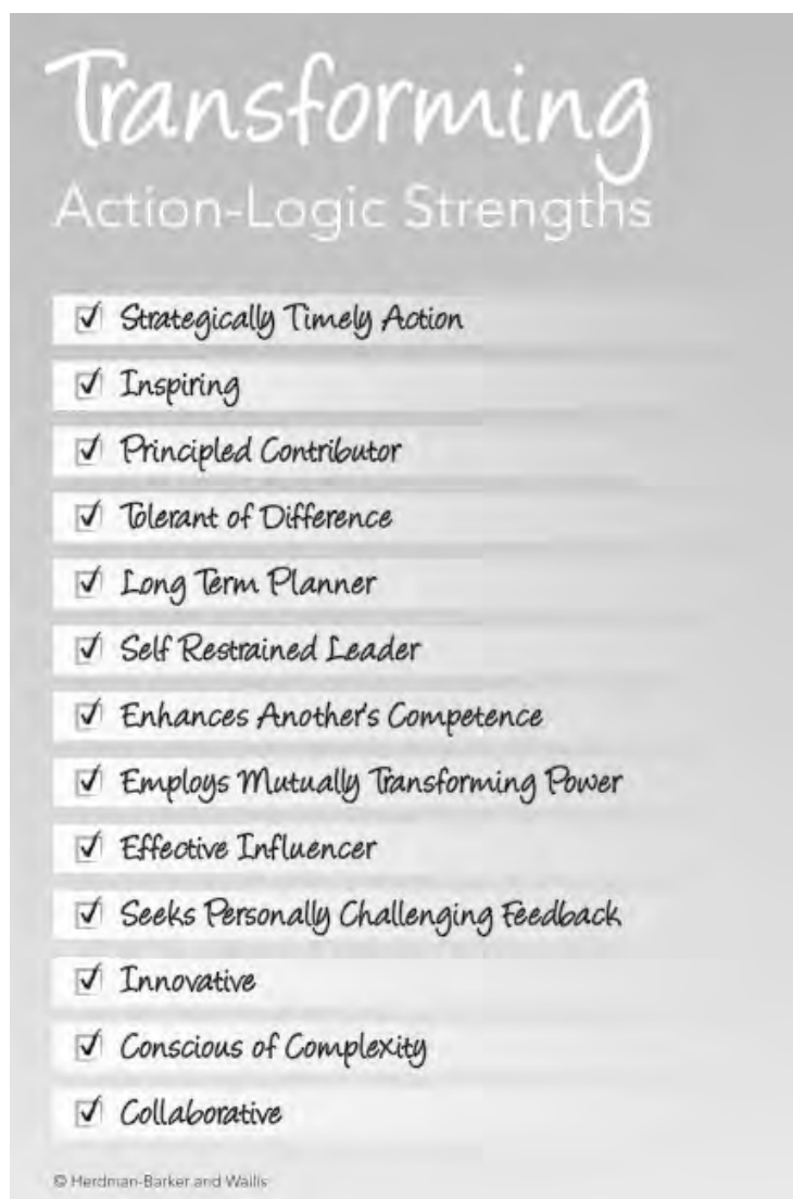
Figure 2. Transforming Action-Logic